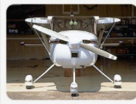
The GlaStar's folding wings then came in

handy. Just get an off-road crane to lift the