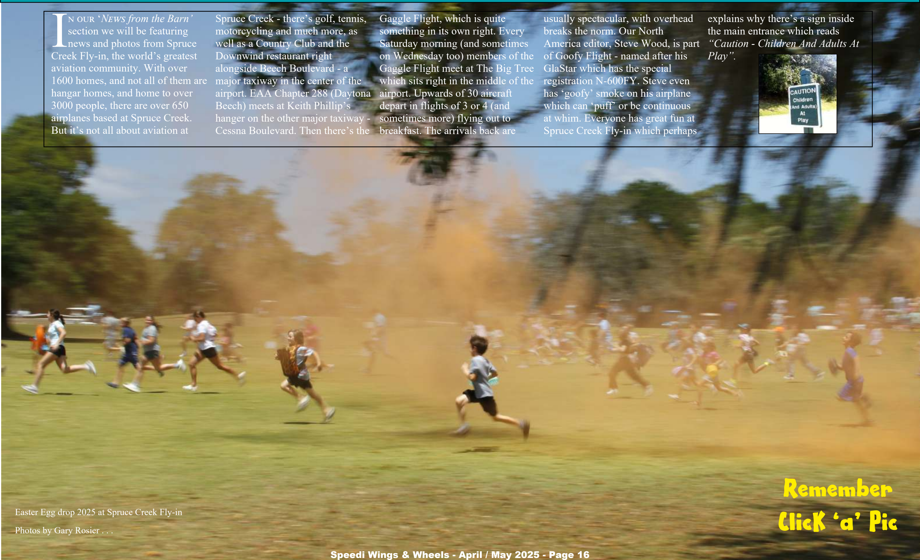
Easter Egg drop 2025 at Spruce Creek Fly-in