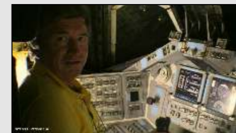
Photo above - in the commander's seat

placed between the pilot and co-pilot seats, over a bank of switches. To get into the Commander's seat you had to kneel on this mat, grasp two hand holds (with strict instructions not to touch the HUD) and pull yourself into position.