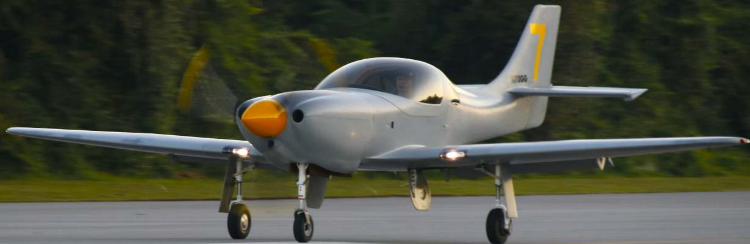
Here's a look at the planes at Spruce Creek Fly-in on a Saturday in October 2023.