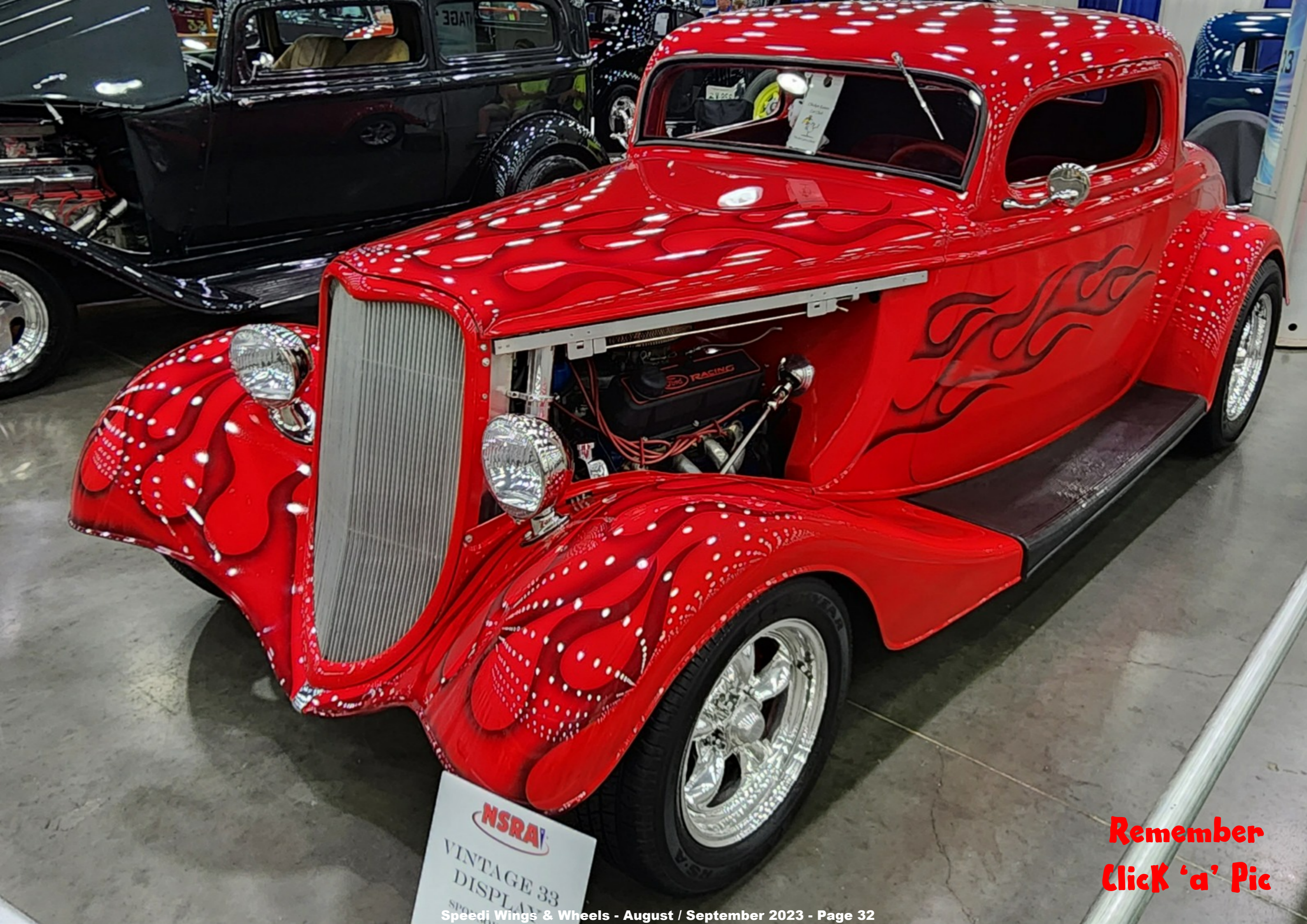
NSRA VINTAGE 33 DISPLAY